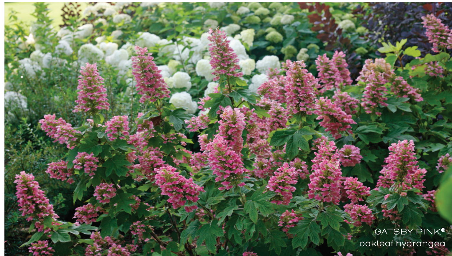
GATSBY PINK® oakleaf hydrangea

Learn more about specific native habitats and wildlife value at wildflower.org/plants-main