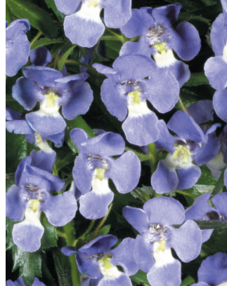
ANGELFACE® Dresden Blue Angelonia hybrid Ansky USPP17155 Can/2283