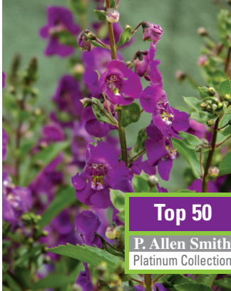
ANGELFACE® Blue Angelonia hybrid Anbluin USPPAF Can/PBRAAF