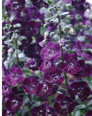
ANGELFACE® Dark Violet Angelonia hybrid Andeevii USPP19870 Can/PBRAAF