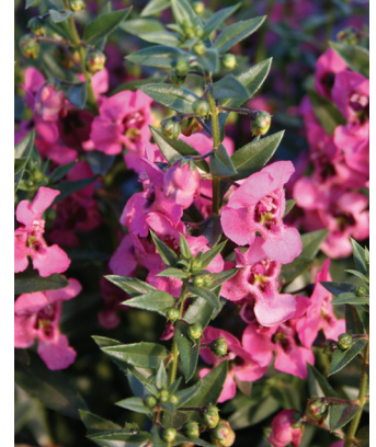
ANGELFACE® Pink Angelonia hybrid Anpinkini USPPAF Can/PBRAAF