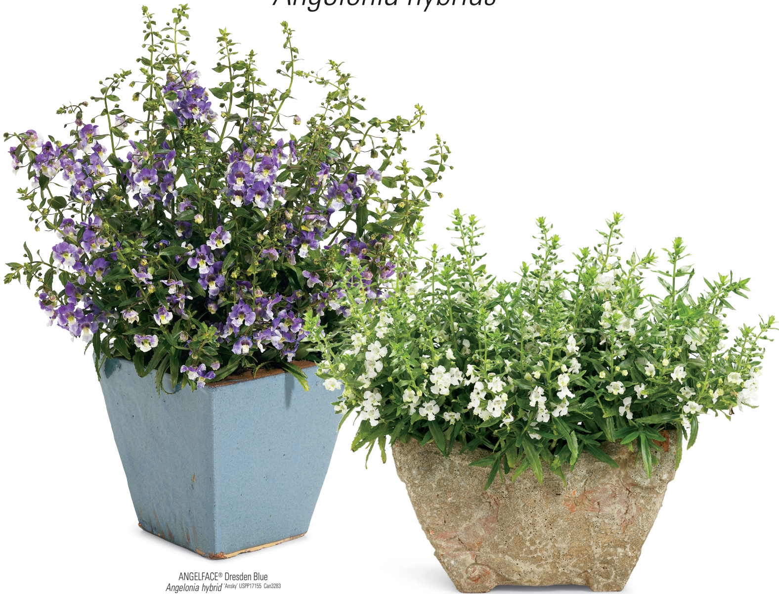
ANGELFACE® Dresden Blue Angelonia hybrid *Ansky USPP17155 Can3283