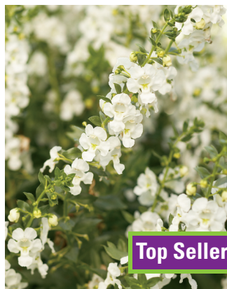
ANGELFACE® White Angelonia hybrid Anwhitini USPP19866 Can/PBRAAF