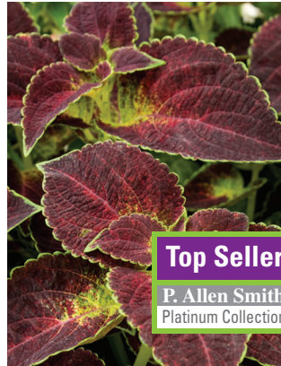
COLORBLAZE® Dipt in Wine Solenostemon scutellarioides Height: 20-36"