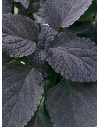
COLORBLAZE® Dark Star Solenostemon scutellarioides Height: 12-24"