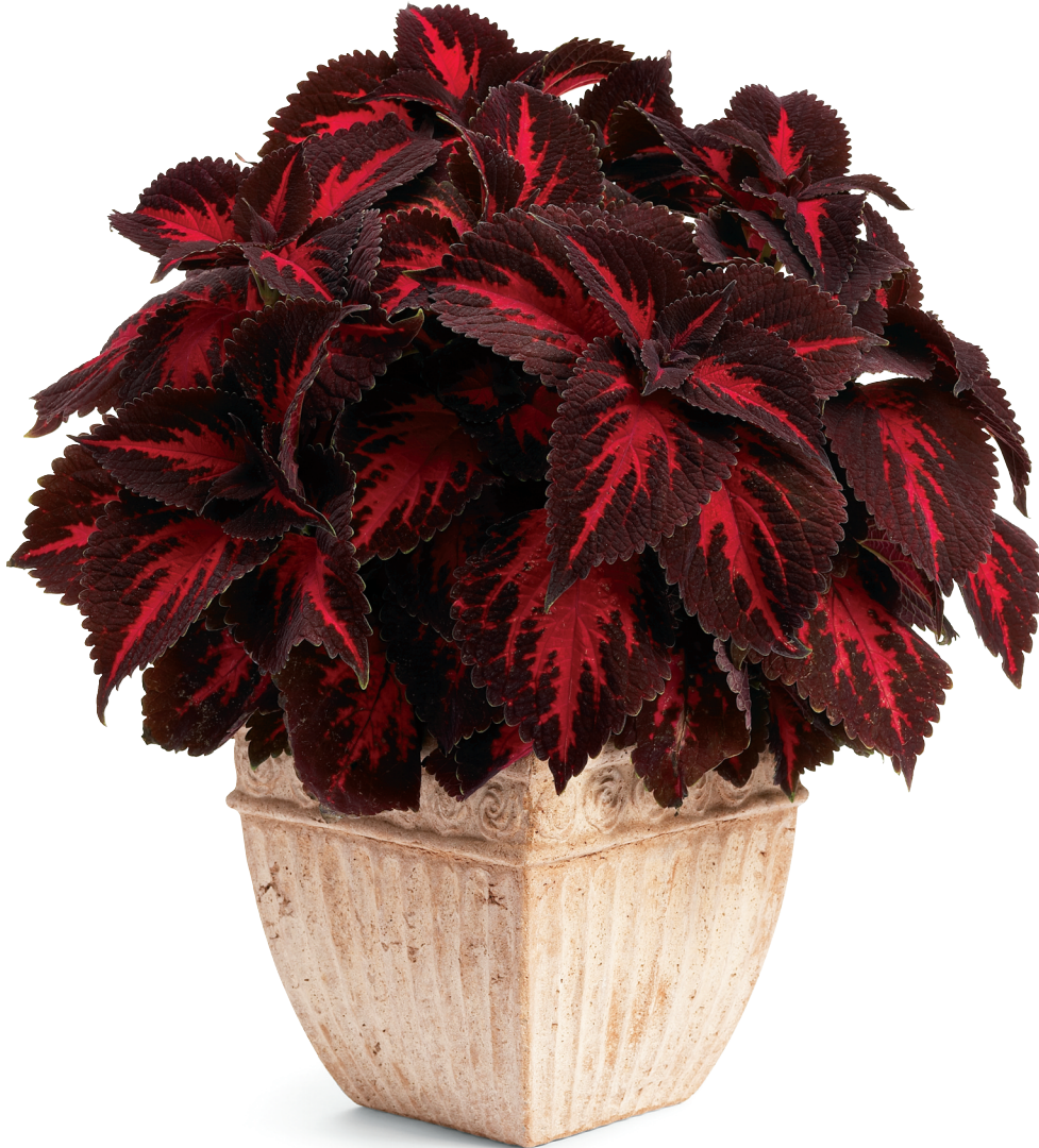
COLORBLAZE® Kingswood Torch Solenostemon scutellarioides

With vibrant color and exceptional performance, the ColorBlaze collection of Coleus is a must-have for your spring line-up. These seven foliage plants are bold, versatile, easy to grow, and extremely popular with gardeners. All are late-flowering varieties that hold their form throughout the season. They are tolerant of varying light conditions and are among the fastest-selling plants in any program.