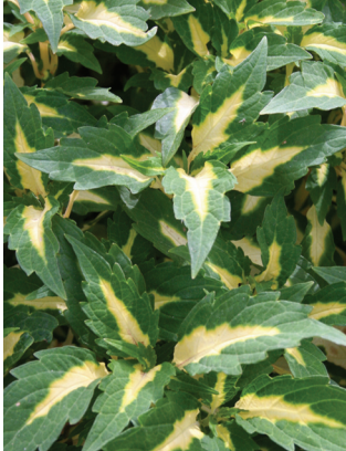
COLORBLAZE® ALLIGATOR TEARS™ Solenostemon scutellarioides Height: 20-30"