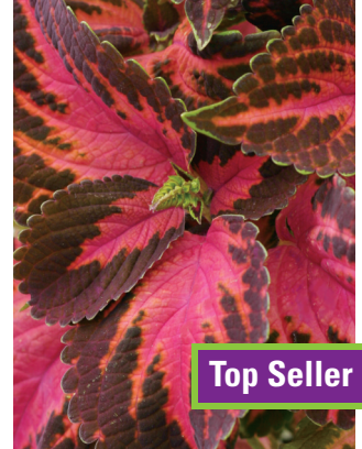
COLORBLAZE® Kingswood Torch Solenostemon scutellarioides Height: 36-42"