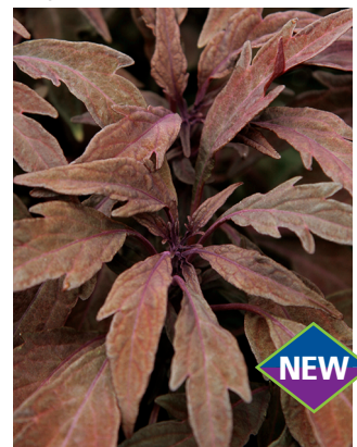
COLORBLAZE® Velvet Mocha Solenostemon scutellarioides Height: 12-24"