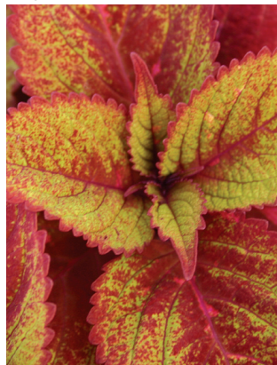
COLORBLAZE® ROYAL GLISSADE™ Solenostemon scutellarioides Height: 24-30"