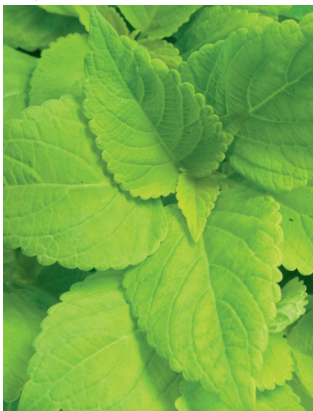
COLORBLAZE® LifeLime Solenostemon scutellarioides Height: 20-36"