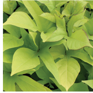
'Sweet Caroline Light Green' Ipomoea batatas USPP18572 Can2901