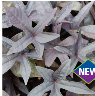
'Sweet Caroline Raven' Ipomoea batatas "NCORNSP-015SCR" USPPAF CanPBRAF