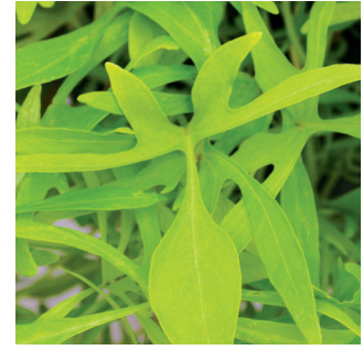
ILLUSION® Emerald Lace Ipomoea batatas "NCORNSP-012EMLC" USPPAF CanPBRAF