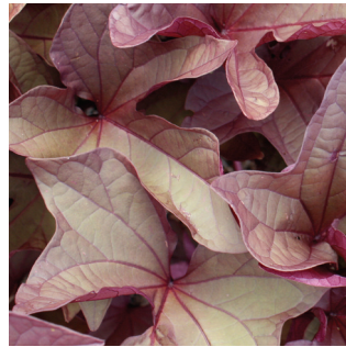
'Sweet Caroline Red' Ipomoea batatas USPP17483 Can2976