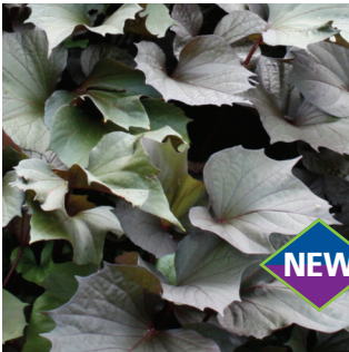
'Sweet Caroline Bewitched Improved' Ipomoea batatas "NCORNSP-014BWPI" USPPAF CanPBRAF