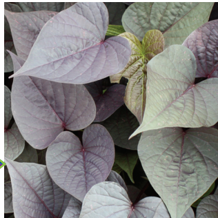
'Sweet Caroline Sweetheart Purple' Ipomoea batatas USPP18573 Can2902