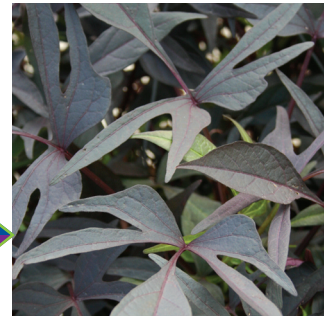
ILLUSION® Midnight Lace Ipomoea batatas "NCORNSP-011MDNTLC" USPPAF CanPBRAF