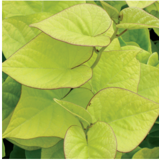
'Sweet Caroline Sweetheart Light Green' Ipomoea batatas USPP18572 Can2901