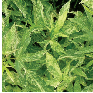
'Sweet Caroline Green Yellow' Ipomoea batatas USPP18673 Can2903