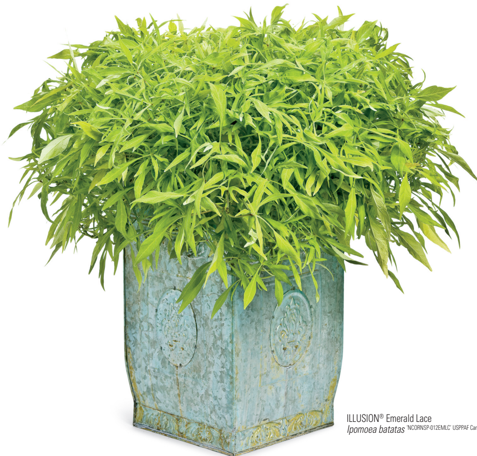
ILLUSION® Emerald Lace Ipomoea batatas 'NCOINSP-012EMLC' USPPAF CanPBRAF

The Sweet Potato Vine has become a gardener's favorite because of the variety it adds in color and form. However, its rapid growth can also be overpowering in the garden. Our new Illusion line adds a unique leaf form in Sweet Potato Vines with a more controlled growth habit. Both Midnight Lace and Emerald Lace are mounding growers that have very compact, very dense, lacy foliage, which will not overrun the garden or containers. These are showy plants that will behave themselves on the retail bench. The popular Sweet Caroline varieties now have the power of the Proven Winners brand behind them.