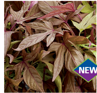
ILLUSION® Garnet Lace Ipomoea batatas "NCORNSP-013GNLC" USPPAF CanPBRAF