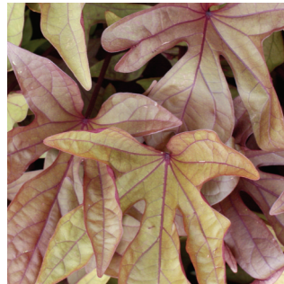
'Sweet Caroline Bronze' Ipomoea batatas USPP15437 Can2973