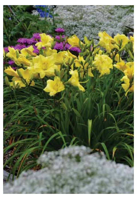
RAINBOW RHYTHM® 'Going Bananas' Hemerocallis

H: 28-32" / W: 34-38" / Z: 4-9 / E: Full Sun