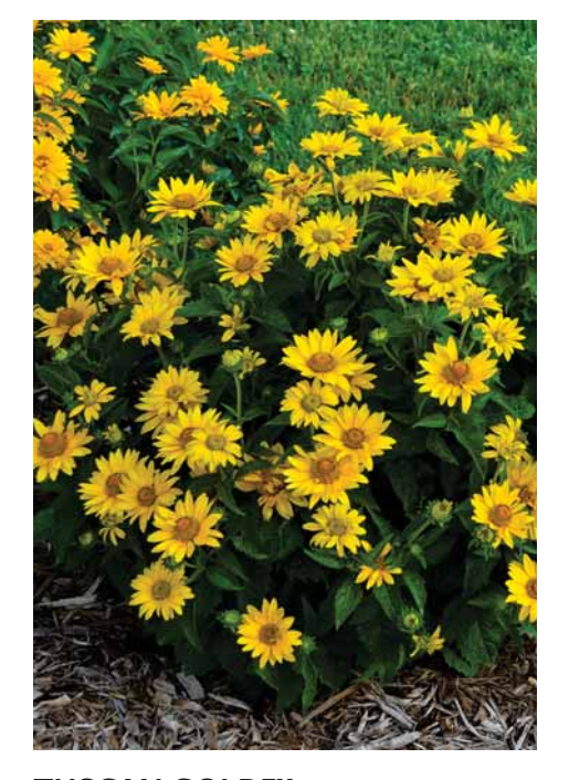
TUSCAN GOLD™ Heliopsis helianthoides

H: 24-30" / W: 38-42" / Z: 4-9 / E: Full Sun