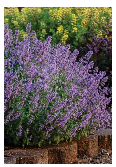
'Cat's Meow' Nepeta faassenii

Tidy, dense habit that keeps its shape all season long.