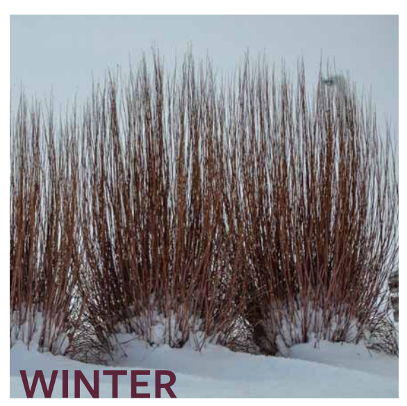
PRAIRIE WINDS® 'Blue Paradise' Schizachyrium scoparium