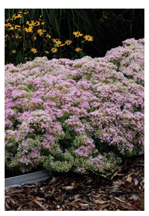
ROCK 'N GROW® 'Pure Joy' Sedum

H: 6-8" / W: 12-14" / Z: 4-9 / E: Full - Part Sun