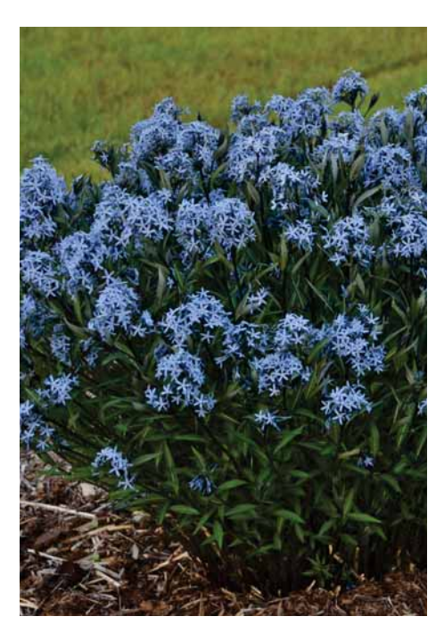
'Storm Cloud' Amsonia tabernaemontana

Perfectly rigid dome shape. H: 10-12" / W: 16-20" / Z: 3-9 / E: Full Sun