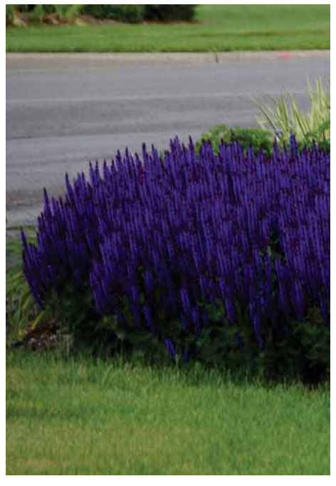
COLOR SPIRES® 'Violet Riot' Salvia

H: 24-32" / W: 20-24" / Z: 4-9 / E: Full Sun