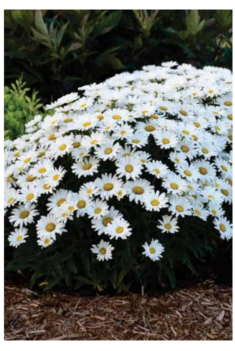
AMAZING DAISIES® DAISY MAY® Leucanthemum superbum

H: 17-20" / W: 24-36" / Z: 3-8 / E: Full Sun