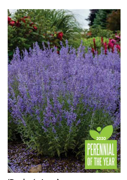
'Denim 'n Lace' Perovskia atriplicifolia

Free flowering, heavy repeat blooms. H: 12-24" / W: 10-14" / Z: 5-9 / E: Full Sun