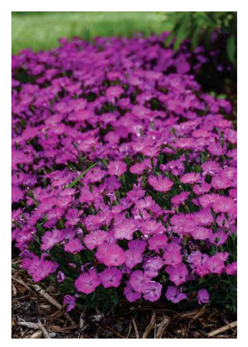
'Paint the Town Fuchsia' Dianthus

Much longer life in the landscape, far more prolific in blooming.