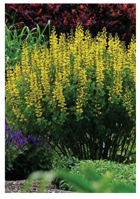
DECADENCE® 'Lemon Meringue' Baptisia

H: 19-22" / W: 18-24" / Z: 3-9 / E: Full Sun