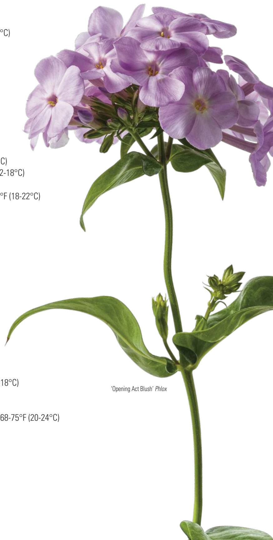
'Opening Act Blush' Phlox

See perennial chart on p.194-195 for more detailed cultural information.