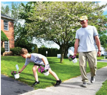
Above: Pheasant Run Greenhouse in Glen Rock, PA recently gave away 300 Supertunia Vista® Jazzberry® Petunias to customers—a fun and engaging idea for online promotion!