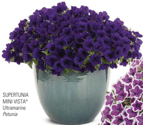
SUPERTUNIA MINI VISTA® Ultramarine Petunia