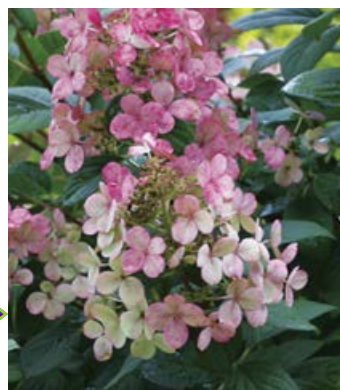
LITTLE QUICK FIRE™ Hydrangea paniculata