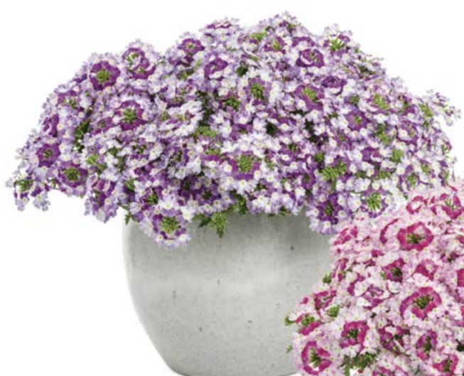
SUPERBENA® Sparkling Amethyst Verbena