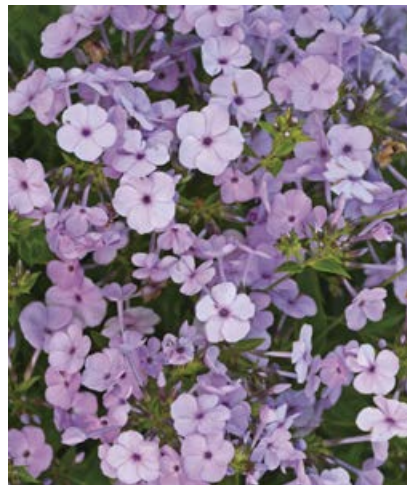
'Opening Act Blush' Phlox USPPAF Can/PBR/AF