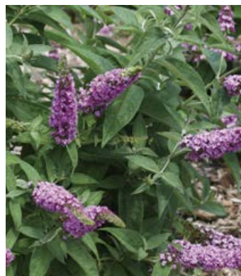
LO & BEHOLD® 'Pink Micro Chip' Buddleia