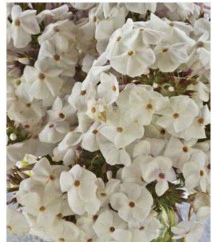
'Opening Act White' Phlox USPPAF Can/PBR/AF