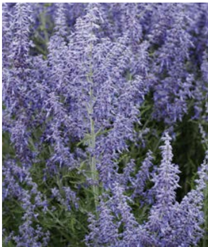
'Denim 'n Lace' Perovskia atriplicifolia USPPAF Can/PBR/AF