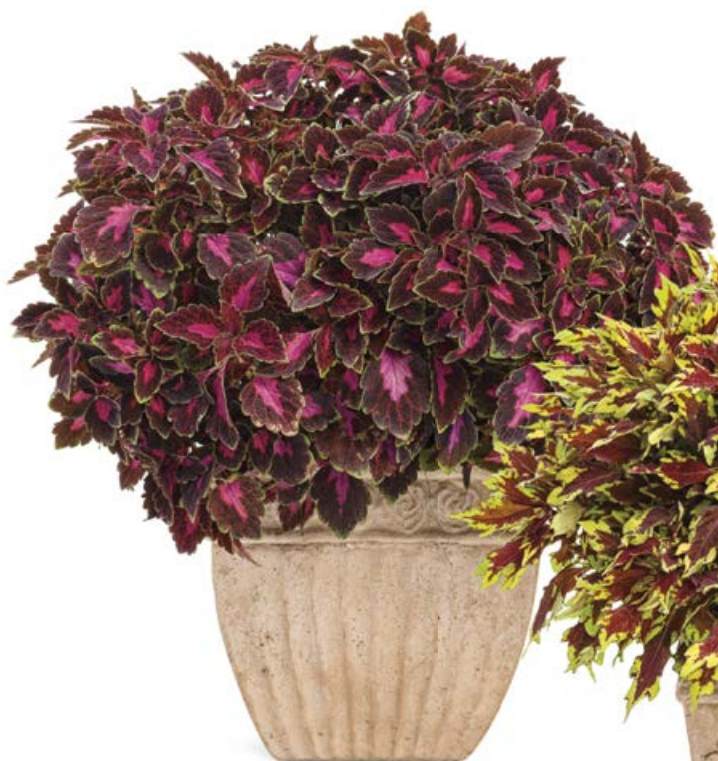
COLORBLAZE® Velveteen Solenostemon scutellarioides