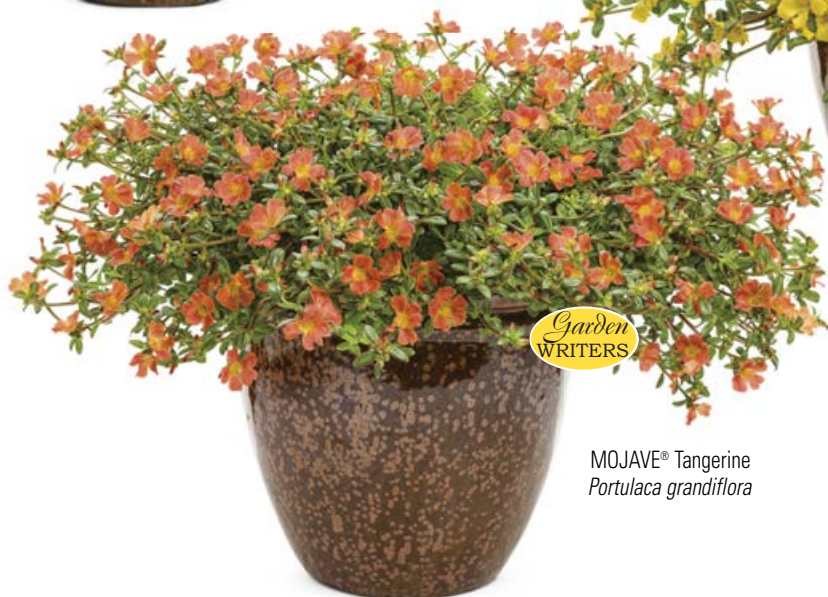
MOJAVE® Tangerine Portulaca grandiflora