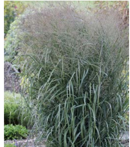
PRAIRIE WINDS™ 'Apache Rose' Panicum virgatum USPPAF Can/PBR/AF