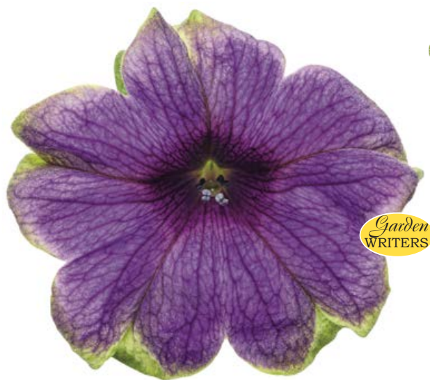
SUPERTUNIA® PICASSO IN BLUE™ Petunia