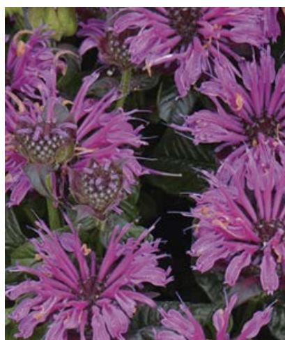
'Leading Lady Plum' Monarda USPPAF CanPBRAF