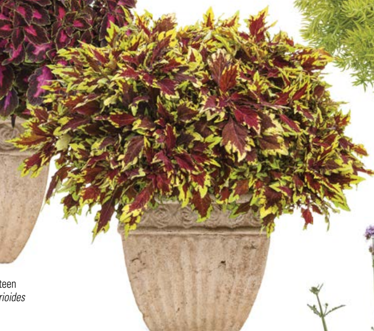
COLORBLAZE® Apple Brandy Solenostemon scutellarioides