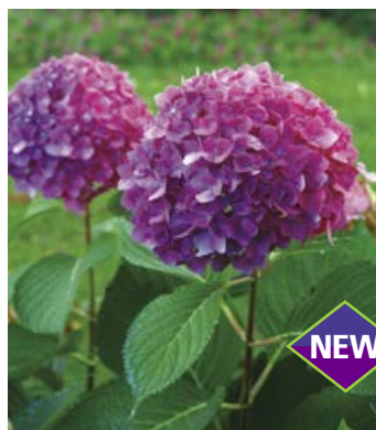
LET'S DANCE® RAVE™ Hydrangea macrophylla