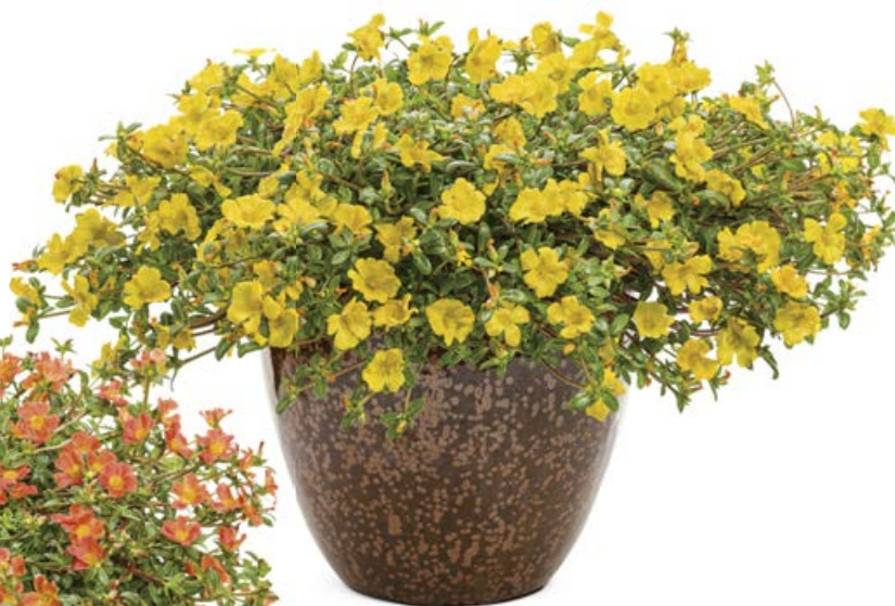
MOJAVE® Yellow Portulaca grandiflora