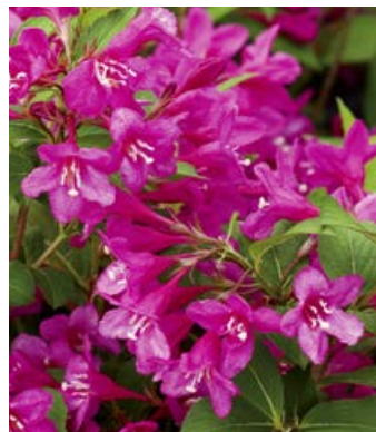
SONIC BLOOM® Series Weigela florida Sonic Bloom® is a trademark of the Syngenta Group Company