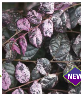
JAZZ HANDS® Variegated Loropetalum chinense