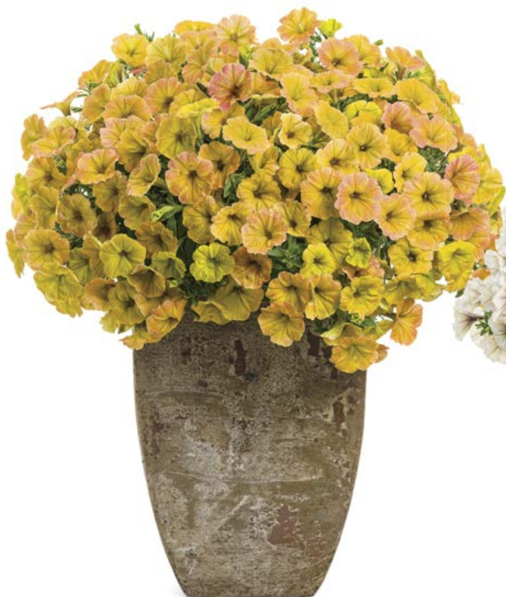
SUPERTUNIA® Honey Petunia