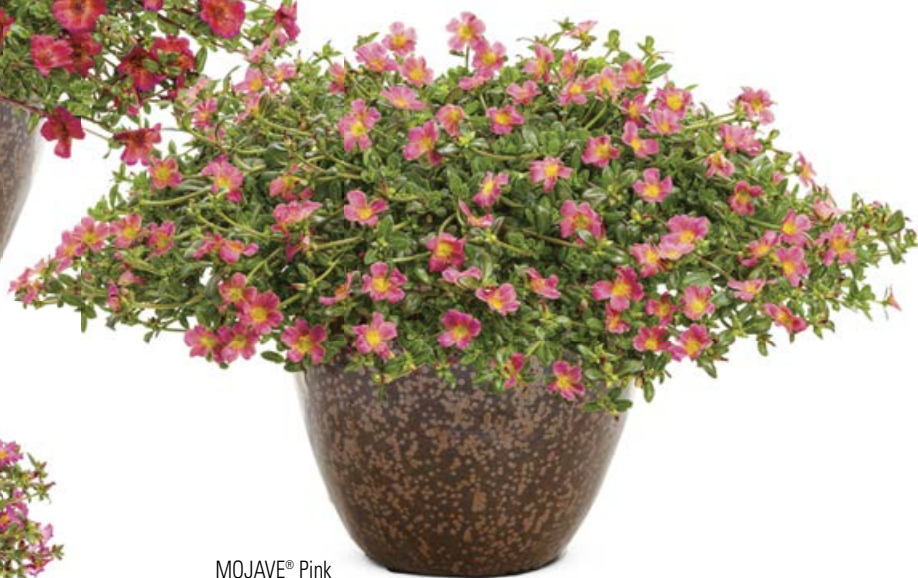
MOJAVE® Pink Portulaca grandiflora