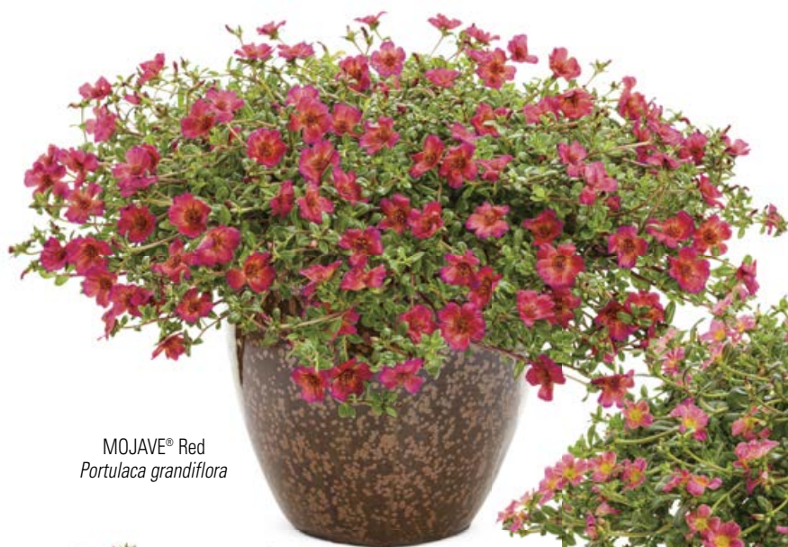
MOJAVE® Red Portulaca grandiflora