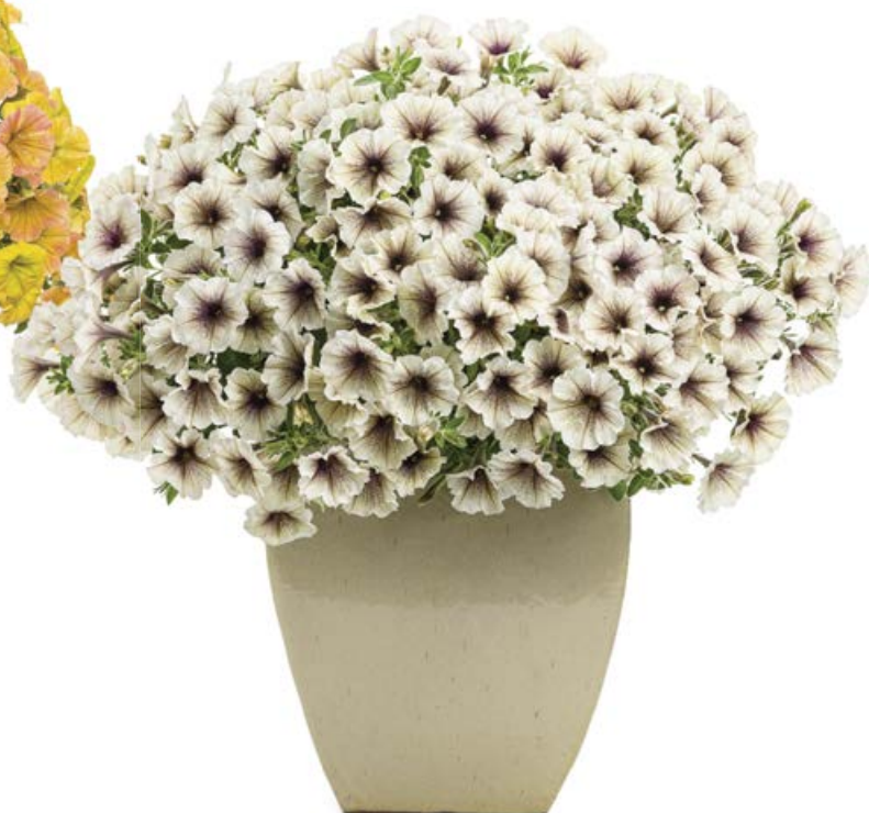
SUPERTUNIA® Latte Petunia