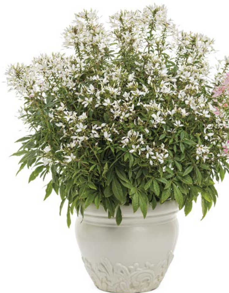
SEÑORITA BLANCA™ Improved Cleome