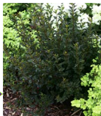
TINY WINE® Physocarpus opulifolius SMPTOTW USPPAF CanFBRAF