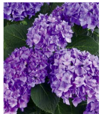
LET'S DANCE® RHYTHMIC BLUE™ Hydrangea macrophylla