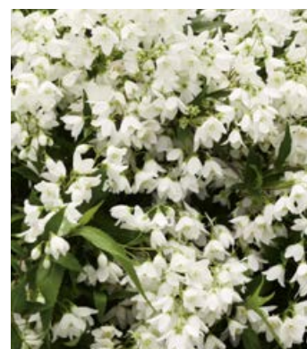
YUKI SNOWFLAKE™ Deutzia