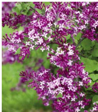
BLOOMERANG® Dark Purple Syringa