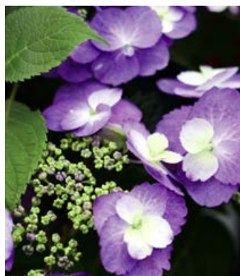
TINY TUFF STUFF™ Hydrangea serrata