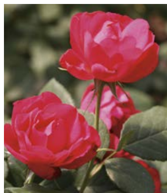
OSO EASY® Double Red Rosa