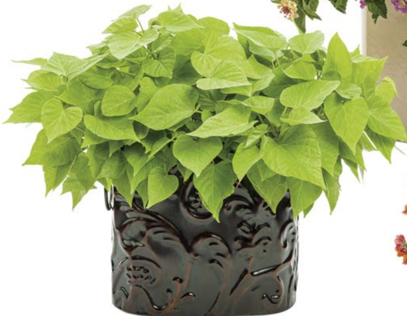
Sweet Caroline Sweetheart Lime Ipomoea batatas