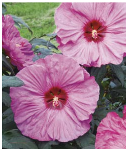
SUMMERIFIC® 'Berry Awesome' Hibiscus USPPAF CanPBRAF