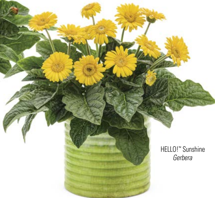
HELLO!™ Sunshine Gerbera