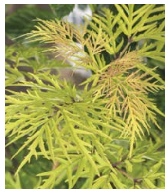
LEMONY LACE™ Sambucus racemosa