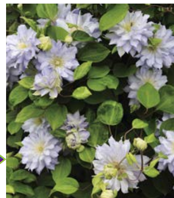
'Diamond Ball' Clematis