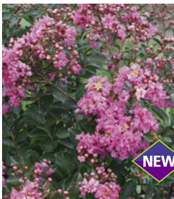
INFINITINI™ Brite Pink Lagerstroemia (Crapemyrtle)