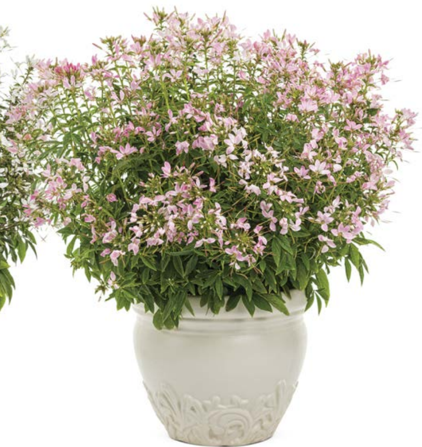
SEÑORITA MI AMOR™ Cleome