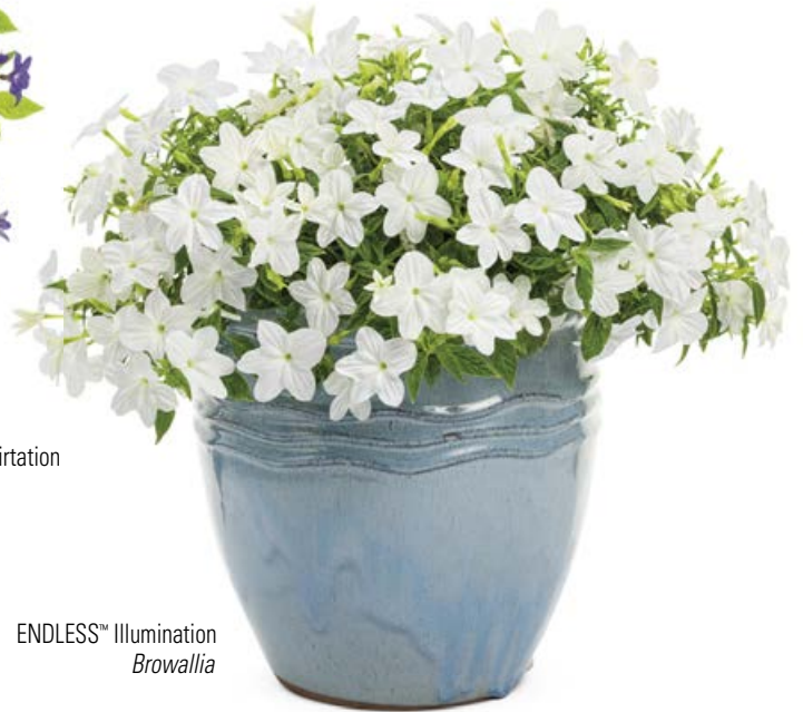
ENDLESS™ Illumination Browallia