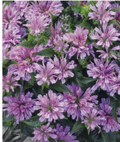
'Pardon My Lavender' Monarda didyma USPPAF Can/PBR/AF