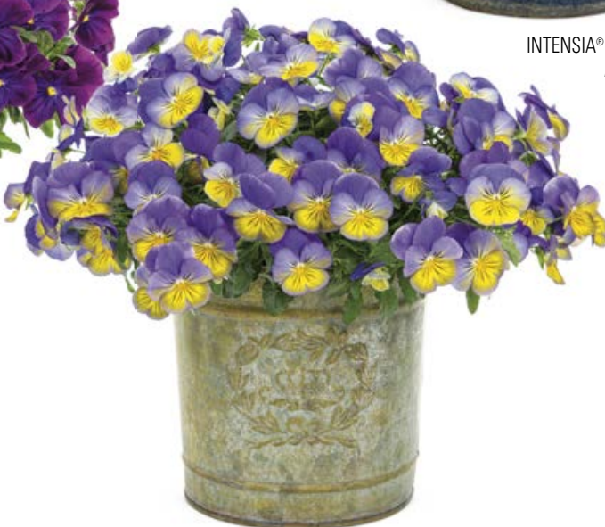
ANYTIME™ Iris Viola x wittrockiana