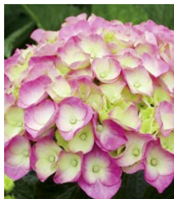
CITYLINE® Series Hydrangea macrophylla