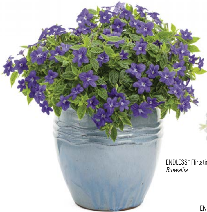
ENDLESS™ Flirtation Browallia