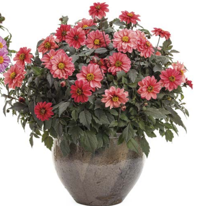
DAHLIGHTFUL™ Sultry Scarlet Dahlia