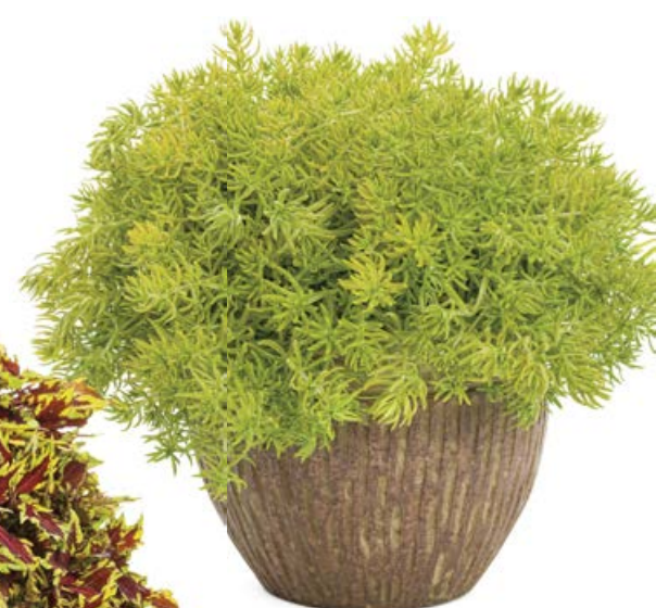
LEMON CORAL™ Sedum rupestre