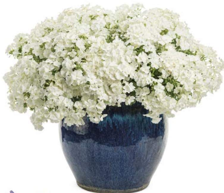
INTENSIA® White Improved Phlox