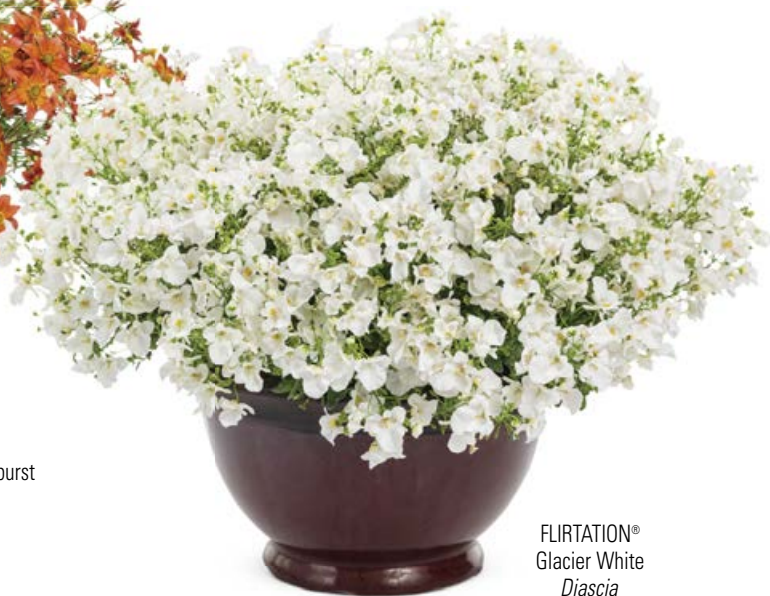
FLIRTATION® Glacier White Diascia