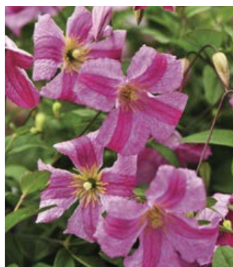
PINK MINK® Clematis