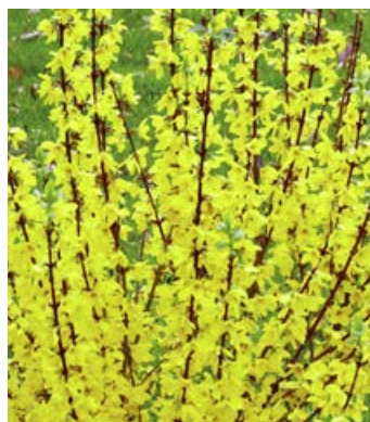
SHOW OFF® Sugar Baby Forsythia