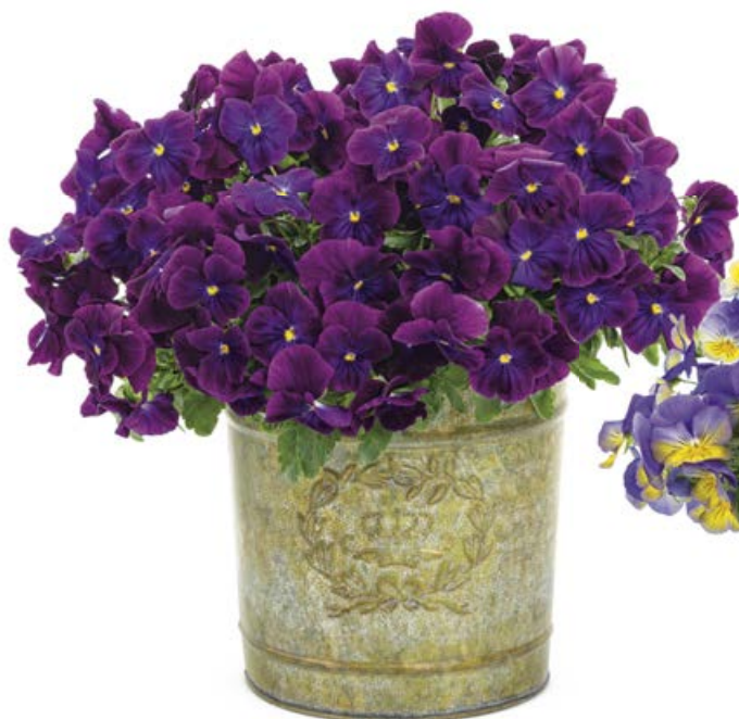
ANYTIME™ Plum Good Viola x wittrockiana