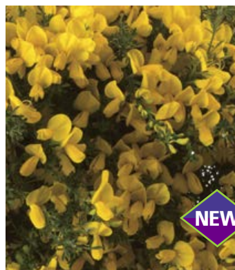
SISTER GOLDEN HAIR™ Cytisus scoparius