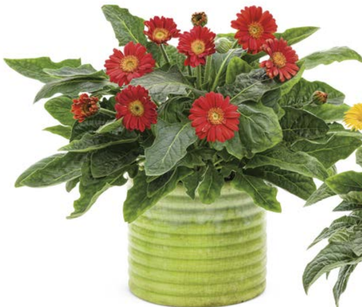
HELLO!™ Miss Scarlet Gerbera