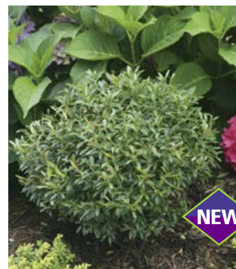
GEM BOX™ Ilex glabra