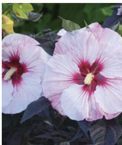
SUMMERIFIC® 'Perfect Storm' Hibiscus USPPAF CanPBRAF