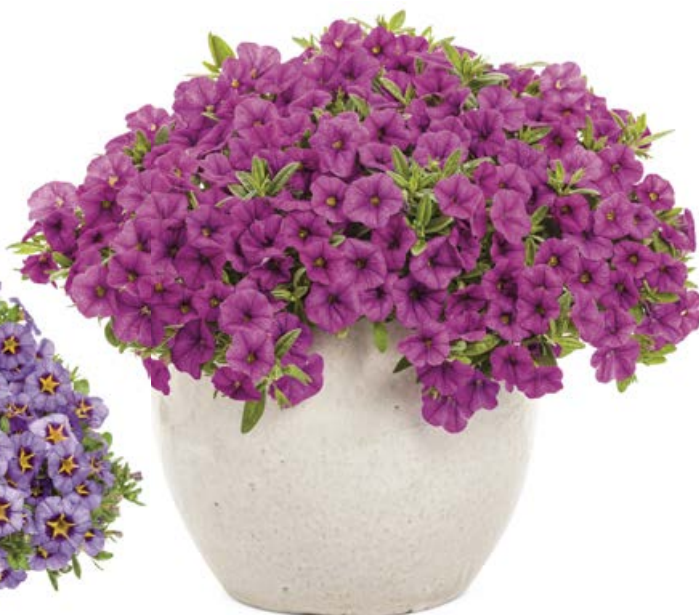
SUPERBELLS® Garden Rose Calibrachoa