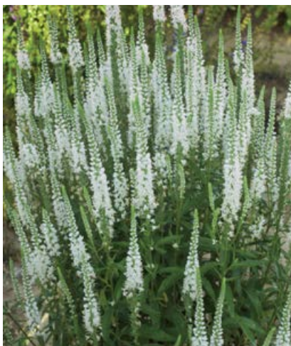
MAGIC SHOW® 'White Wands' Veronica USPPAF Can/PBR/AF