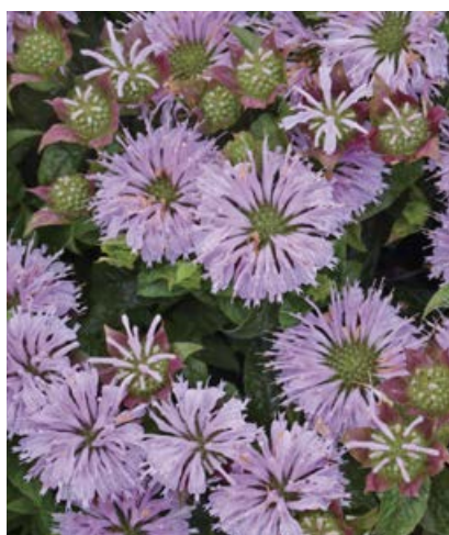
'Leading Lady Lilac' Monarda USPPAF CanPBRAF