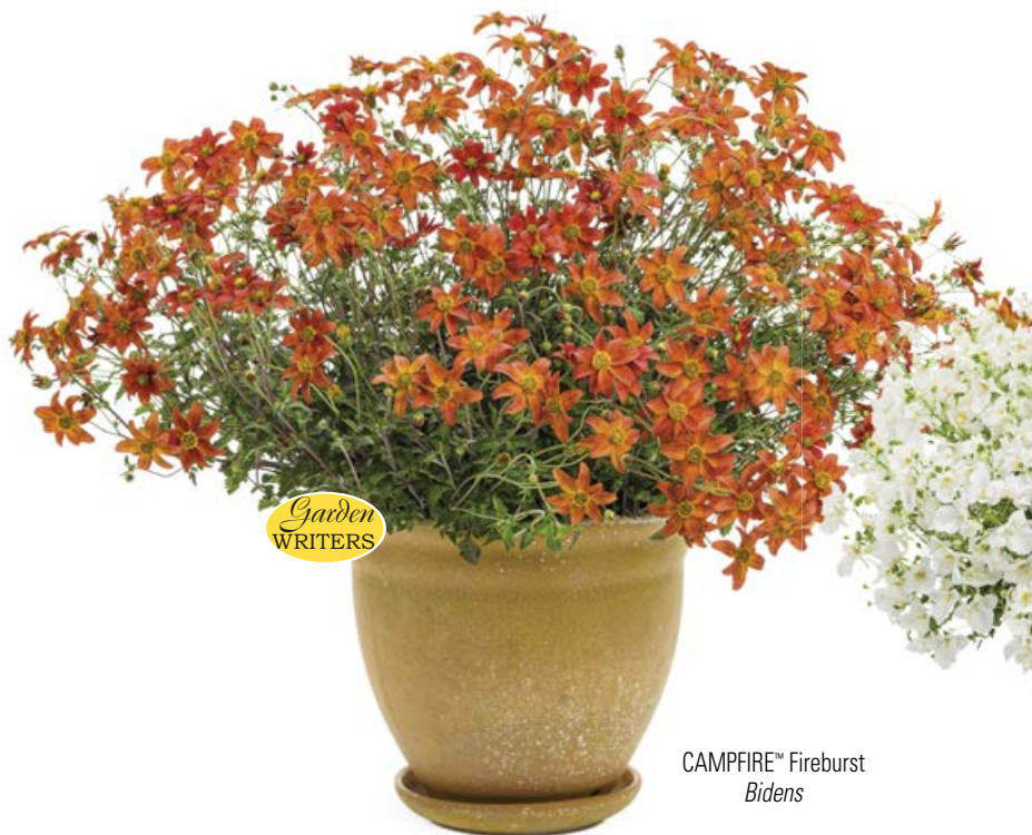
CAMPFIRE™ Fireburst Bidens