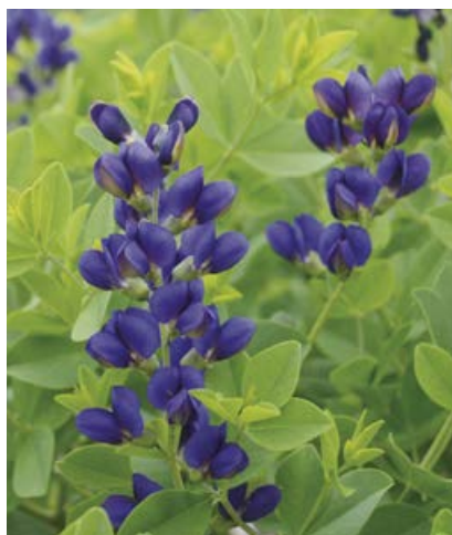
DECADENCE® 'Sparkling Sapphires' Baptisia USPPAF CanPBRAF