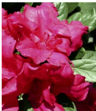
BLOOM-A-THON® Series Rhododendron (Azalea)