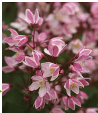
YUKI CHERRY BLOSSOM™ Deutzia