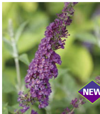
'Miss Violet' Buddleia