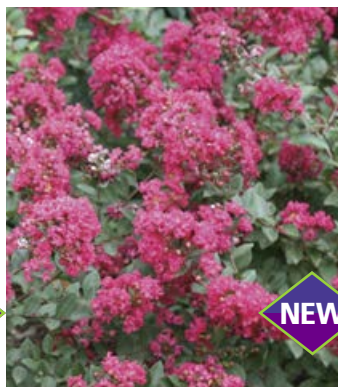
INFINITINI™ Magenta Lagerstroemia (Crapemyrtle)