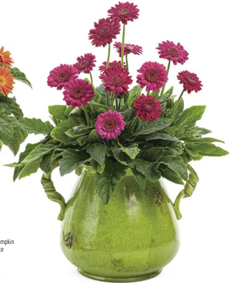
HELLO!™ Magentamen Gerbera