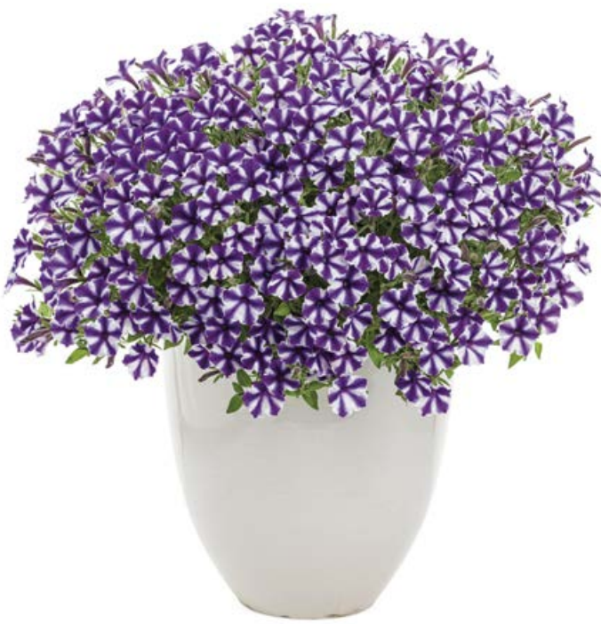
SUPERTUNIA® Violet Star Charm Petunia