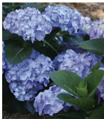
LET'S DANCE® BLUE JANGLES® Hydrangea macrophylla