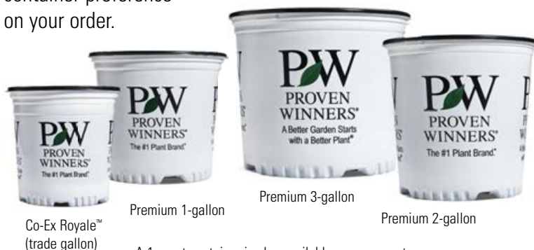
Co-Ex Royale™ (trade gallon)

All Proven Winners Perennials are sold with white branded containers and Proven Winners Perennials labels. Your supplier will be happy to ship the recommended container sizes if you do not specify your container preference on your order.