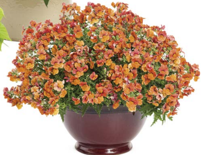
SUNSATIA® Blood Orange Nemesia