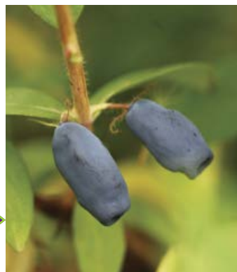
SUGAR MOUNTAIN® Blue Lonicera caerulea