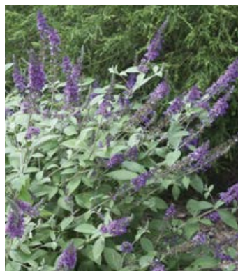
LO & BEHOLD® 'Blue Chip Jr.' Buddleia