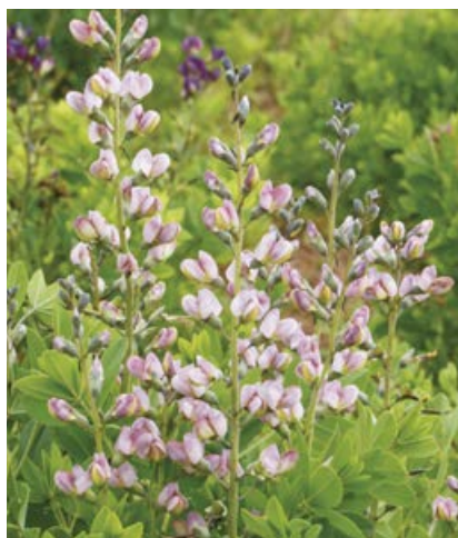
DECADENCE® 'Pink Truffles' Baptisia USPPAF CanPBRAF

The Proven Winners Perennial collection expands in 2016, and will offer gardeners even more ways they can easily beautify their landscape with varieties that return year after year. From sun to shade, we continue to expand our offerings of easy-to-love and easy-to-care for perennials.