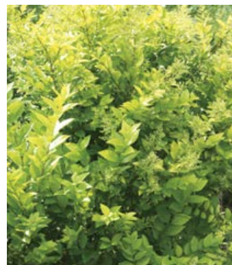
GOLDEN TICKET® Ligustrum