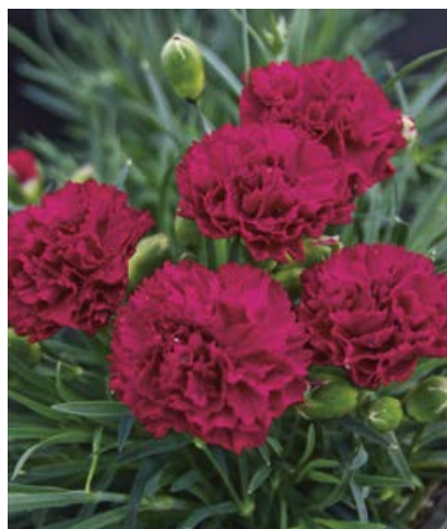
FRUIT PUNCH® 'Cranberry Cocktail' Dianthus USPPAF CanPBRAF