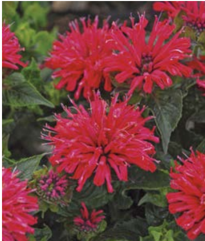
'Pardon My Cerise' Monarda didyma USPPAF Can/PBR/AF