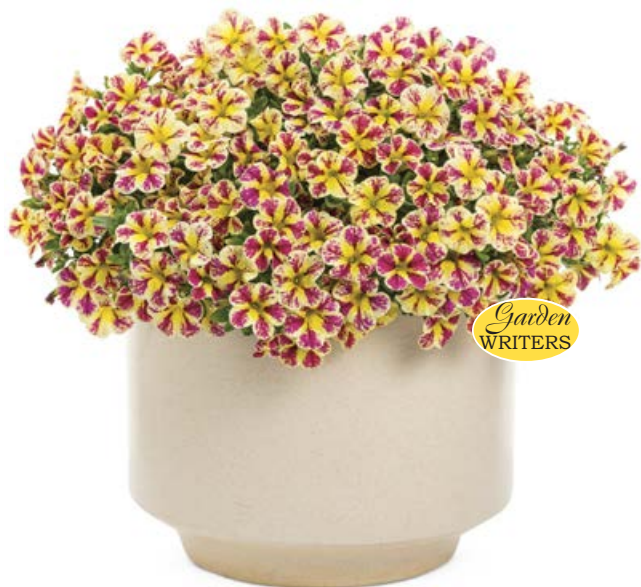
SUPERBELLS® Holy Moly!™ Calibrachoa