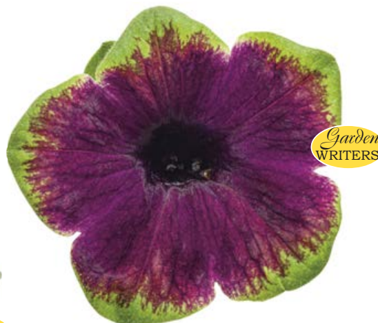
SUPERTUNIA® PICASSO IN BURGUNDY™ Petunia