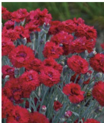
FRUIT PUNCH® 'Maraschino' Dianthus USPPAF CanPBRAF