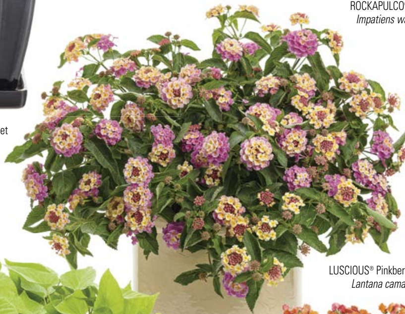
LUSCIOUS® Pinkberry Blend Lantana camara