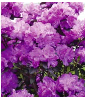
'Amy Cotta' Rhododendron