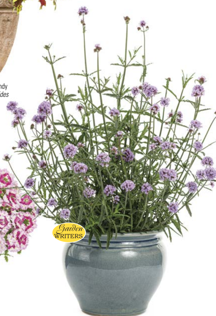
METEOR SHOWER™ Verbena bonariensis