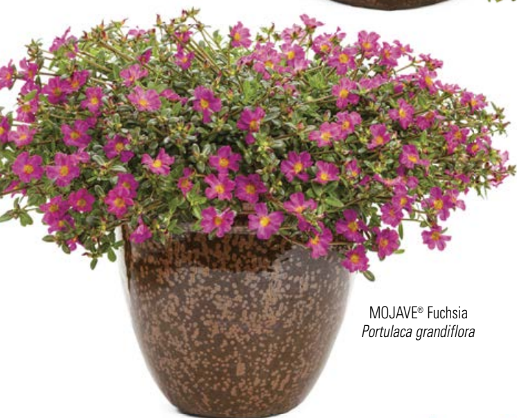
MOJAVE® Fuchsia Portulaca grandiflora