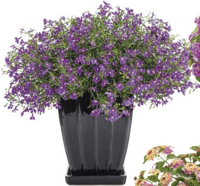
LUCIA® Ultraviolet Lobelia