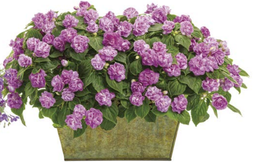
ROCKAPULCO® Wisteria Impatiens walleriana