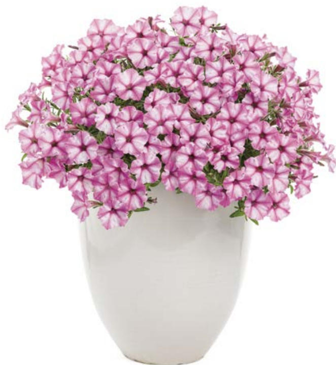
SUPERTUNIA® Pink Star Charm Petunia