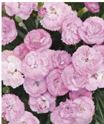
FRUIT PUNCH® 'Sweetie Pie' Dianthus USPPAF CanPBRAF