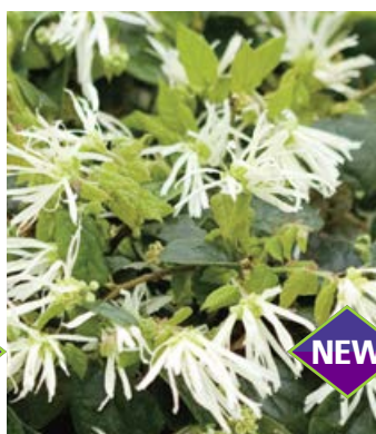
JAZZ HANDS® Dwarf White Loropetalum chinense