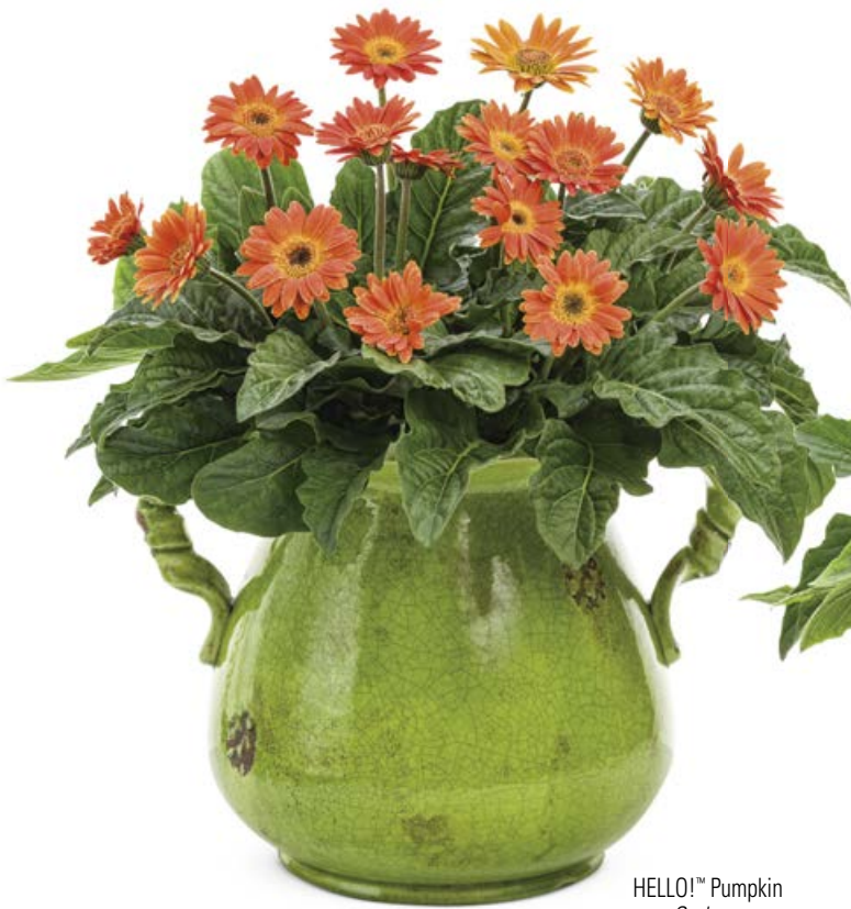
HELLO!™ Pumpkin Gerbera