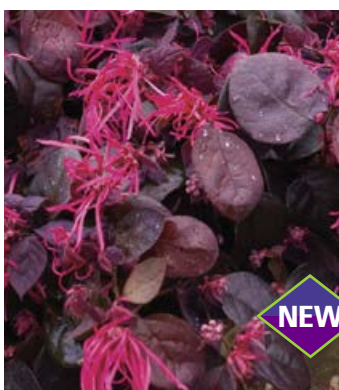
JAZZ HANDS® Bold Loropetalum chinense