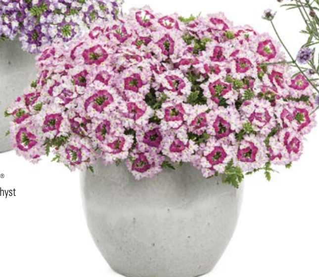
SUPERBENA® Sparkling Ruby Verbena