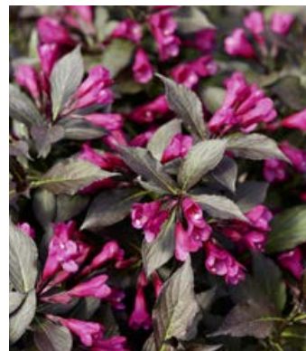
SPILLED WINE® Weigela florida