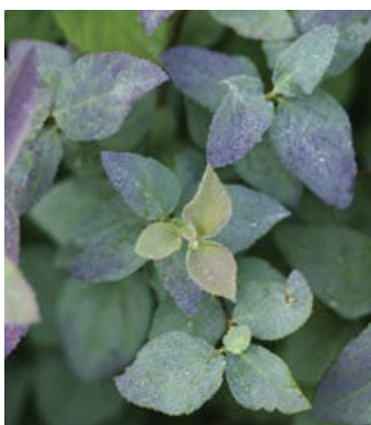
DOUBLE PLAY® Series Spiraea