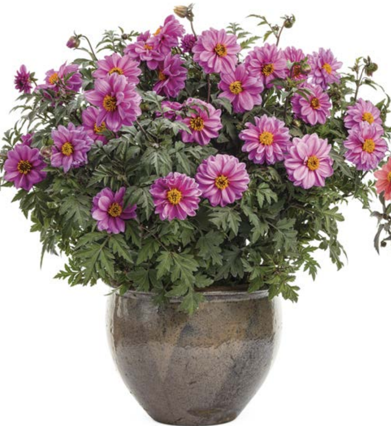
DAHLIGHTFUL™ Lively Lavender Dahlia