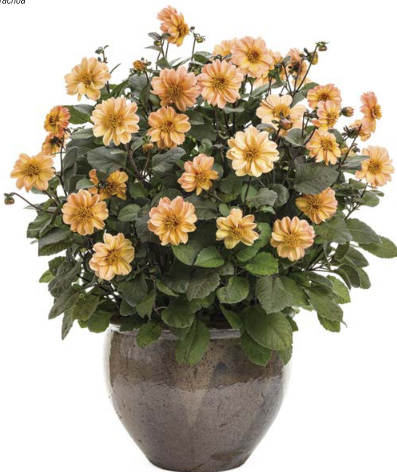
DAHLIGHTFUL™ Georgia Peach Dahlia