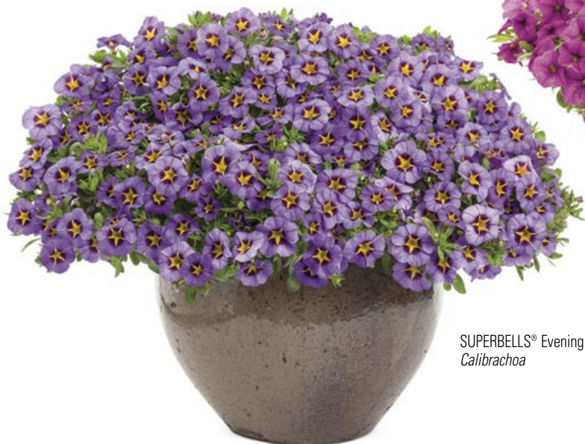
SUPERBELLS® Evening Star Calibrachoa