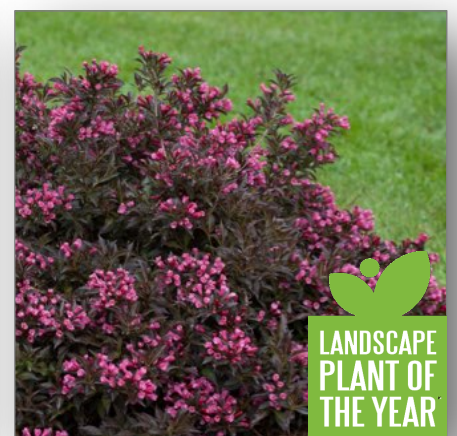
Spilled Wine® Weigela