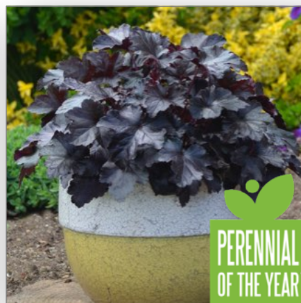
Primo™ 'Black Pearl' Heuchera