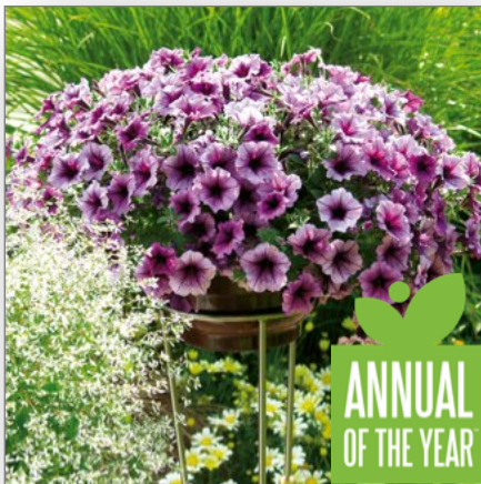
Supertunia® Bordeaux™ Petunia

For more information on this program, visit www.provenwinners.com/national-plant and www.nationalplantoftheyear.com .