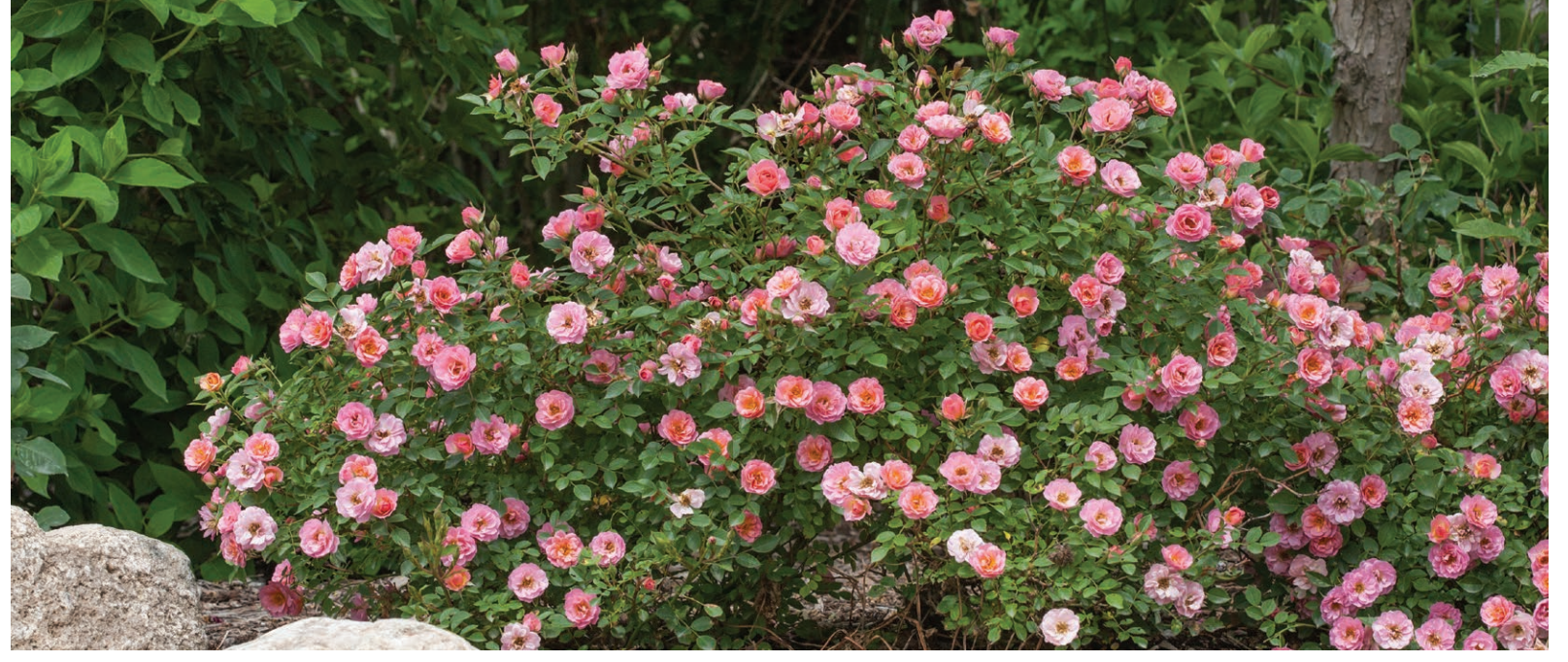
OSO EASY® Petit Pink

A staff and visitor favorite in our trial gardens, OSO EASY® Petit Pink rose is like a modern version of 'The Fairy' with deeper color and better hardiness – in fact, it's a whole zone hardier. Of all the roses we grow, this one blooms the latest into autumn and is often seen laced in frost through November. We're not the only fans of this charming plant: it earned a prestigious American Rose Society Award of Excellence.