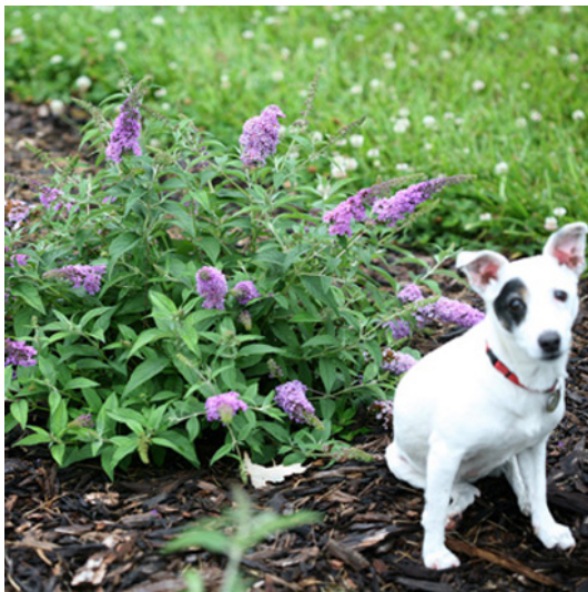
Lo & Behold® 'Lilac Chip' Buddleia