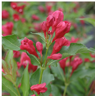
Sonic Bloom™ Red Weigela florida