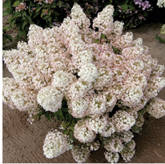
Bobo™ Hydrangea paniculata