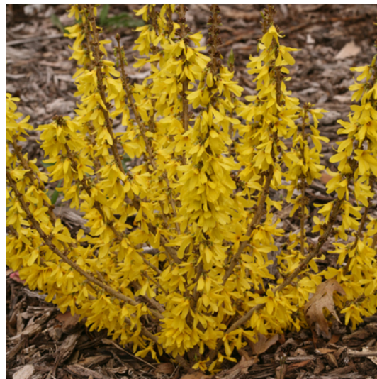
Show Off® Sugar Baby Forsythia