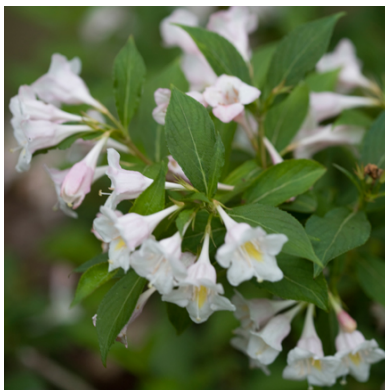
Sonic Bloom™ Pearl Weigela florida