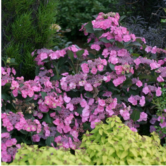
Tuff Stuff™ Hydrangea serrata