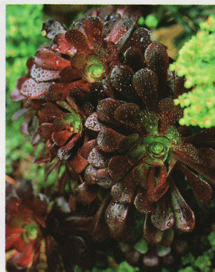
AEONIUM (A. ARBOREUM) Succulent. 'Zwartkop' (pictured) produces giant, 6- to 8-inch nearly black rosettes on stems up to 3 feet tall. Zones 15–17, 20–24.