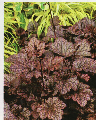
HEUCHERA HYBRIDS Perennial. Many mounding varieties, reaching 8 inches to 2 feet tall, have maroon or brown foliage, including 'Chocolate Ruffles', 'Dolce Licorice', 'Obsidian', and 'Plum Pudding' (pictured). Zones 1–9, 14–24.