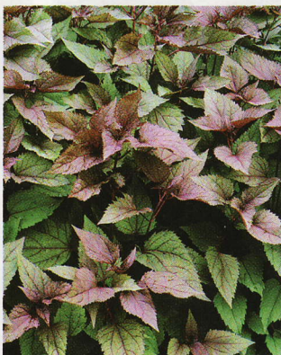
EUPATORIUM RUGOSUM 'CHOCOLATE' Shrub. Bronzy, lance-shaped leaves on plants reaching 4 feet tall and 2 feet wide. Fluffy white flowers in late summer and fall. Sunset climate zones 1–10, 14–17.

Jamie Durie, host of The Victory Garden television series on PBS, loves plants whose foliage provides contrast and punch all year. Here are three of his top picks for gardens in the West; all look stunning beside plants with variegated or lime-colored leaves.