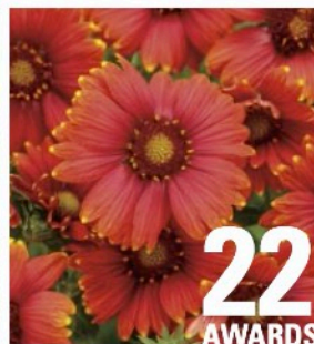
HEAT IT UP™ Scarlet Gaillardia