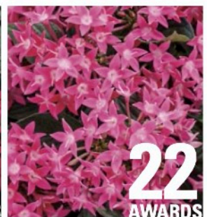
SUNSTAR® Rose Pentas