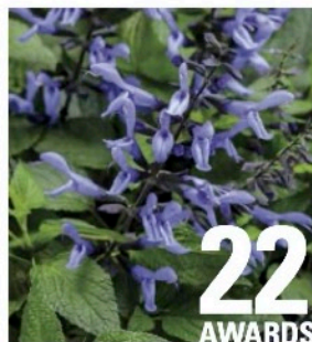
ROCKIN'® BLUE SUEDE SHOES™ Salvia