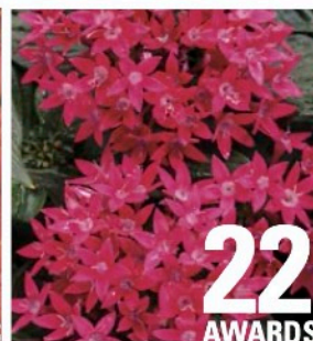
SUNSTAR® Red Pentas