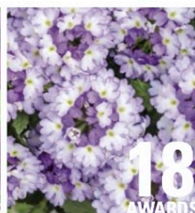
SUPERBENA SPARKLING® Amethyst Improved Verbena