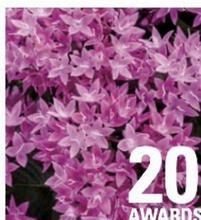
SUNSTAR® Lavender Pentas