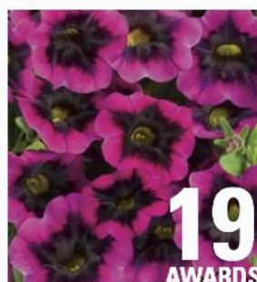
SUPERBELLS® BLACKCURRANT PUNCH™ Calibrachoa