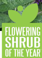
Pugster Blue® Buddleia