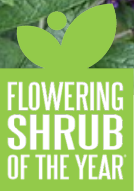
Pugster Blue® Buddleia