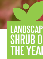
Kodiak® Orange Diervilla