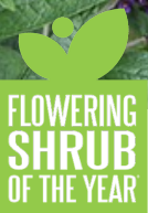
Pugster Blue® Buddleia