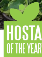
Shadowland® 'Wheee!' Hosta