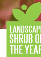
Kodiak® Orange Diervilla