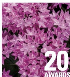
SUNSTAR® Lavender Pentas