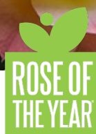
Oso Easy® Italian Ice® Rosa