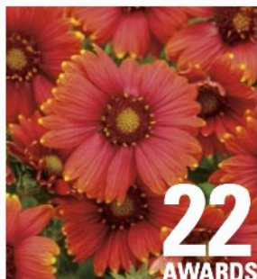
HEAT IT UP™ Scarlet Gaillardia