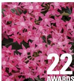
SUNSTAR® Rose Pentas