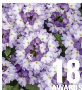
SUPERBENA SPARKLING® Amethyst Improved Verbena