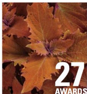
COLORBLAZE® WICKED HOT™ Solenostemon