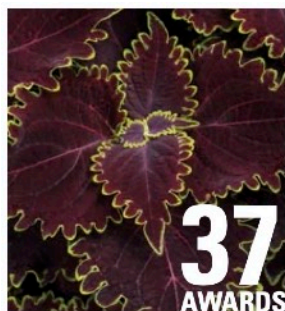
COLORBLAZE® WICKED WITCH™ Solenostemon

108 Varieties, 868 Awards. Don't just take our word for it. University and public garden trial sites across North America have reported these Proven Winners were top performers in 2019. Learn more about trial results in your region at www.provenwinners.com/learn/plant-trials .