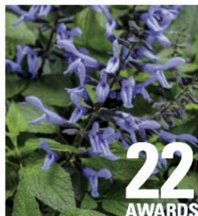
ROCKIN'® BLUE SUEDE SHOES™ Salvia