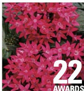
SUNSTAR® Red Pentas