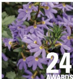
WHIRLWIND® Blue Improved Scaevola