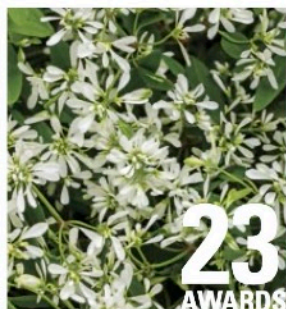
DIAMOND SNOW™ Euphorbia