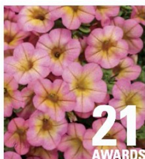
SUPERBELLS® HONEYBERRY™ Calibrachoa