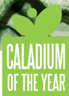
Heart to Heart™ 'White Wonder' Caladium