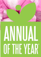
Supertunia® Mini Vista™ Pink Star Petunia