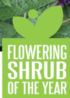
Pugster Blue® Buddleia