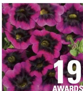
SUPERBELLS® BLACKCURRANT PUNCH™ Calibrachoa