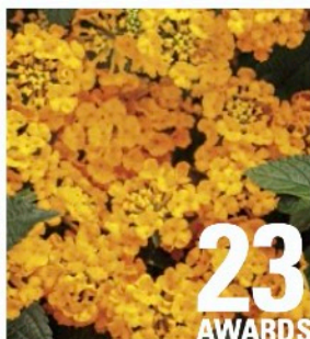
LUSCIOUS® GOLDENGATE™ Lantana