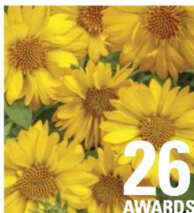
HEAT IT UP™ Yellow Gaillardia