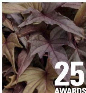
Sweet Caroline RED HAWK™ Ipomoea