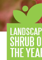
Kodiak® Orange Diervilla