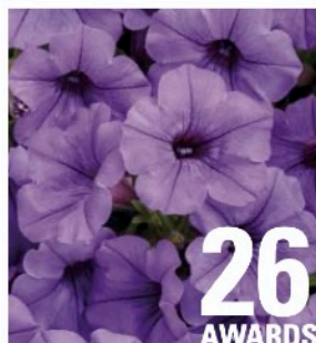
SUPERTUNIA® MINI VISTA™ Indigo Improved Petunia