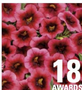
SUPERBELLS® WATERMELON PUNCH™ Calibrachoa