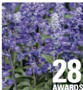
UNPLUGGED® SO BLUE™ Salvia