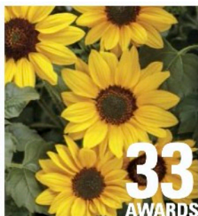
SUNCREDIBLE™ Yellow Helianthus