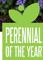
'Cat's Pajamas' Nepeta