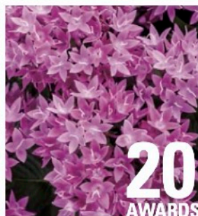
SUNSTAR® Lavender Pentas