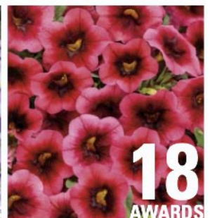
SUPERBELLS® WATERMELON PUNCH™ Calibrachoa