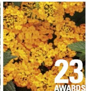
LUSCIOUS® GOLDENGATE™ Lantana