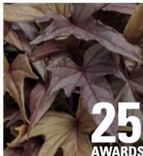
Sweet Caroline RED HAWK™ Ipomoea