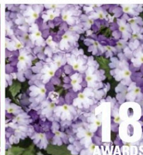
SUPERBENA SPARKLING® Amethyst Improved Verbena