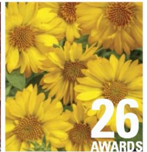
HEAT IT UP™ Yellow Gaillardia