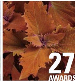
COLORBLAZE® WICKED HOT™ Solenostemon