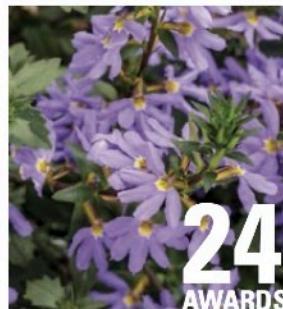
WHIRLWIND® Blue Improved Scaevola