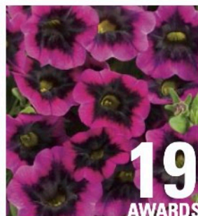
SUPERBELLS® BLACKCURRANT PUNCH™ Calibrachoa