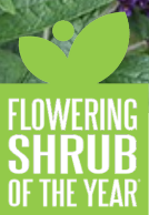
Pugster Blue® Buddleia