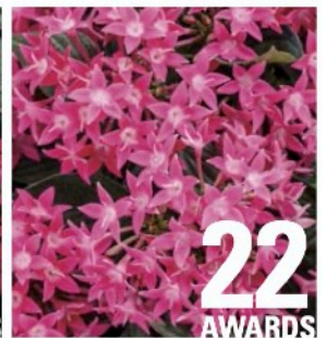
SUNSTAR® Rose Pentas