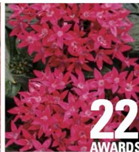
SUNSTAR® Red Pentas