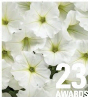
SUPERTUNIA VISTA® SNOWDRIFT™ Petunia