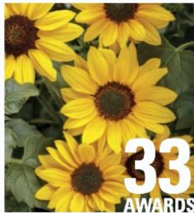
SUNCREDIBLE™ Yellow Helianthus