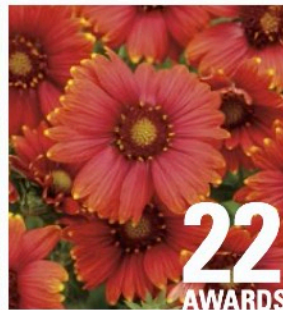
HEAT IT UP™ Scarlet Gaillardia