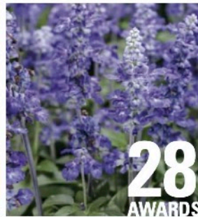
UNPLUGGED® SO BLUE™ Salvia