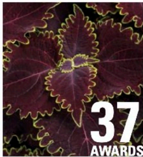
COLORBLAZE® WICKED WITCH™ Solenostemon

108 Varieties, 868 Awards. Don't just take our word for it. University and public garden trial sites across North America have reported these Proven Winners were top performers in 2019. Learn more about trial results in your region at www.provenwinners.com/learn/plant-trials .