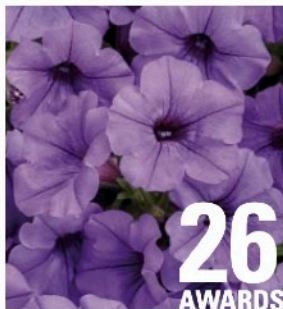
SUPERTUNIA® MINI VISTA™ Indigo Improved Petunia