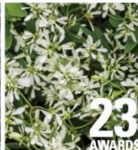
DIAMOND SNOW™ Euphorbia