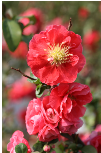
Double Take 'Pink Storm' (Chaenomeles speciosa 'Pink Storm' PPAF)