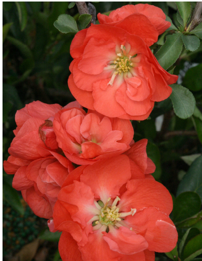
Double Take 'Orange Storm' (Chaenomeles speciosa 'Orange Storm' PPAF)