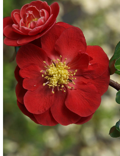
Double Take 'Scarlet Storm' (Chaenomeles speciosa 'Scarlet Storm' PPAF)